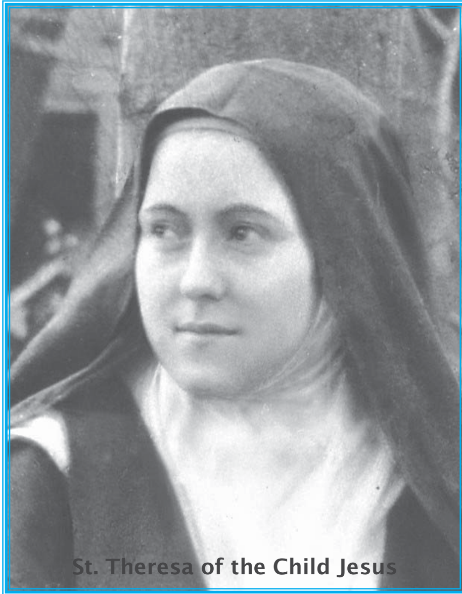
St. Theresa of the Child Jesus

St. John the Baptist Catholic Church continues its annual St. Theresa Novena today, Sunday, September 30, at 2:00 pm.