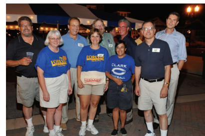
Let the good times roll with members of the class of 1969.